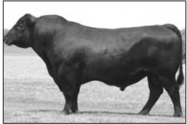
E&B 1680 Precision 1023

• This is a full brother to one of the very top bulls in our 2007 sale going to McCracken Ranch in OK. This bull started a little slow but really has come on. He is a great prospect with great cows in the pedigree. He should be a calving ease herd bull that will add power, maternal, and carcass. Dams WR 2/101.