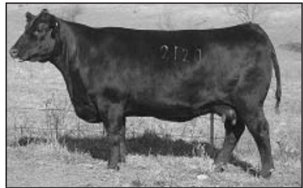
E&B Lady New Design 2120 - Dam of Lot 40

• You will really appreciate these 3133 sons when you see them on virgin heifers. Dams WR 1/100.