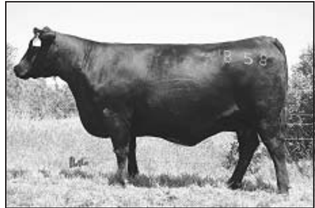
E&B Lady EXT 858 - Grand dam of Lots 71-74