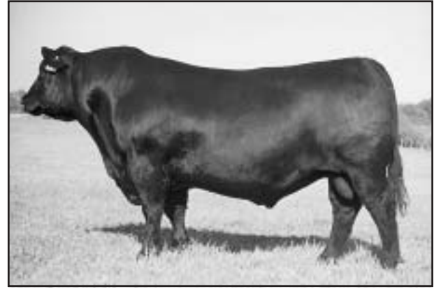
SAV 8180 Traveler 004 - Sire of Lots 8-12