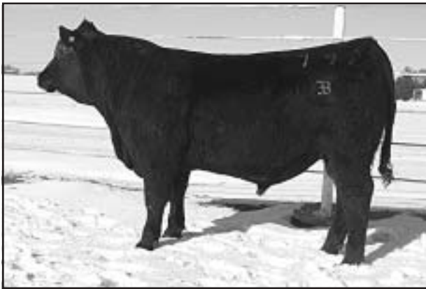
E&B 1023 Precision 792 - Lot 92

• This elite 1023 son is a top herd bull prospect with great cows in the pedigree. 792 is a big scrotal 1023 son that should be a great calving ease bull. This is a bull we have great faith in. You will want to look him up and you will not be disappointed. Dams WR 3/93.