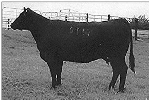
E&b Everelda Queen 0117 - Dam of Lot 172