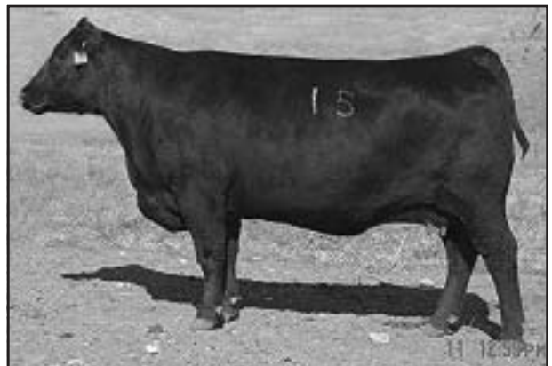
E&B Lady Precision 15 - Dam of Lot 45