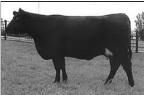
E&B 598 Lady Bando 291 - Dam of Lots 76-78