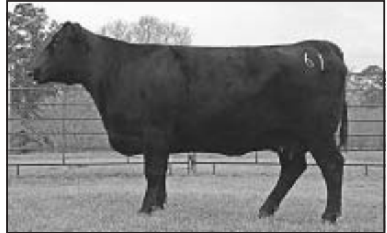
E&b 6807 Lady Traveler 61 Granddam of several of the bull lots.

• 6217 is the youngest fall bull and is a typical powerful 4114 son that will work well on cows. Dams WR 1/101.