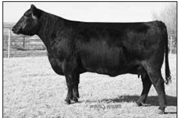
E&B Primrose Lady 332 - Dam of Lots 24 & 25

• The two 1023 sons out of the 332 cow can be your next herd bulls. The 332 cow is in a joint embryo transplant program with Tim Henricks in OK. The 7107 bull will be one of the better bulls selling this spring. Outstanding herd bull. Dams WR 2/104.