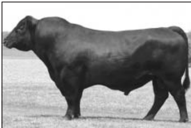
E&B 1680 Precision 1023