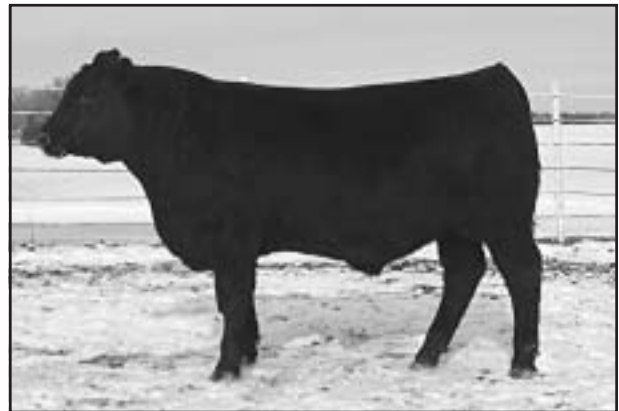
E&B Predestined 716 - Lot 51

• These Predestined sons out of 310 will be one of the best set of full brothers we have raised. Great herd bulls and they are that. Our Predestined daughters are calving and they have beautiful udders on them. Their Dam 310 is moderate framed with near perfect udder also. Dams WR 2/104, YR 2/102.