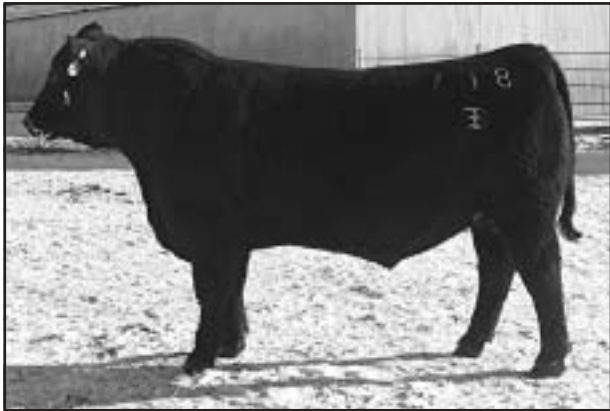
E&B 1023 Precision 718 - Lot 67

• These Centennial sons will have moderate birth with tremendous growth. The Centennial sons will be larger framed but are the right kind if you sell calves by the pound. Dams WR 4/103.