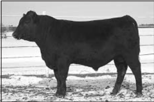
E&B Retail Product 758 - Lot 58

This Retail Product bull should be something special with super cows in his pedigree. Breeders that know pedigrees know the E&B 6807 Lady Traveler 61 cow. The Rainmaker 189 daughter of 61 is also one of the great cows raised on the Ranch. This is an outstanding herd bull prospect. Dams WR 2/100.