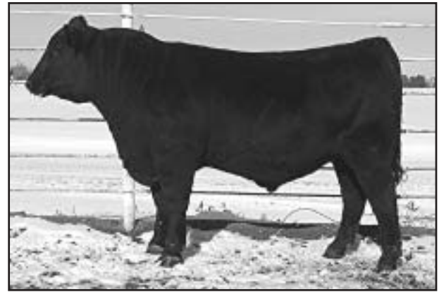
E&B 1023 Precision 7107 - Lot 25