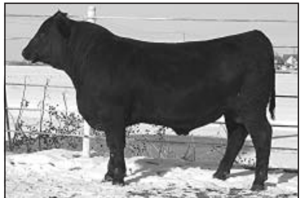
E&B 1023 Precision 770 - Lot 70

• This 1023 son has that herd bull look. His dam 374 is one of the better 878 daughters in the herd. The good cowman will sort this bull out. Dams WR 2/109, YR 2/111.