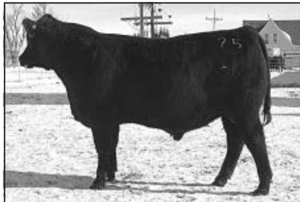
E&B Retail Product 7125

• This calving ease son of Solution should work well on heifers. Dams WR 1/100.