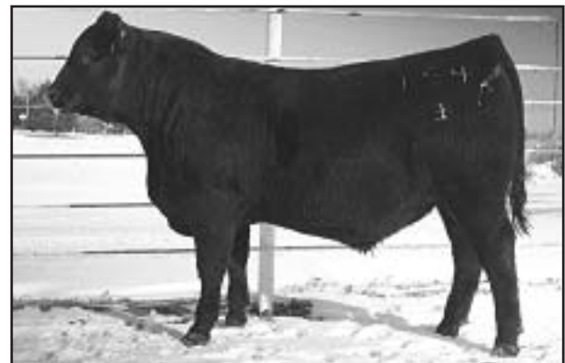
E&B 616 754 - Lot 40