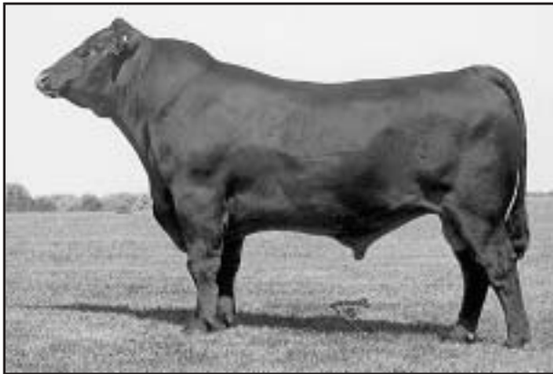
GAR Predestined - Sire of Lots 43-44

* These two Predestined sons of Precision 921 are very good. Predestined has worked well on our Precision daughters. Dams WR 7/105 and YR 6/101.