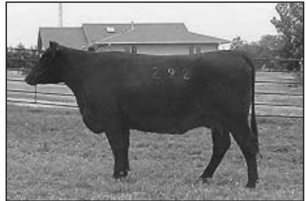
E&B 598 Lady Bando 292 - Dam of Lot 11

• This is another top 004 son out of one of our top donors, E&B Lady Precision 122. These 004 sons should be cow makers. Dams WR 4/98.