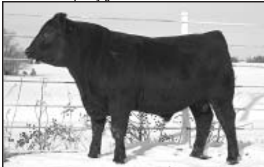
E&B E161 Precision 7104 - Lot 86

• This is a very good flush of E161 sons out of one of our very top Power Alliance 1025 daughters. This should be a great combination. Your next herd bull just might be in this flush. We think their pretty good. Dams WR 4/104.