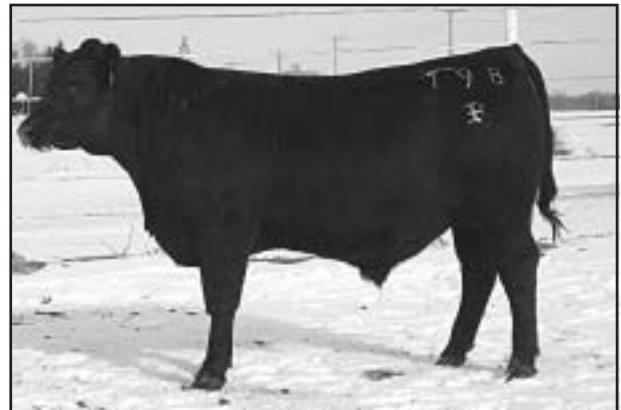
E&B Predestined 798 - Lot 45