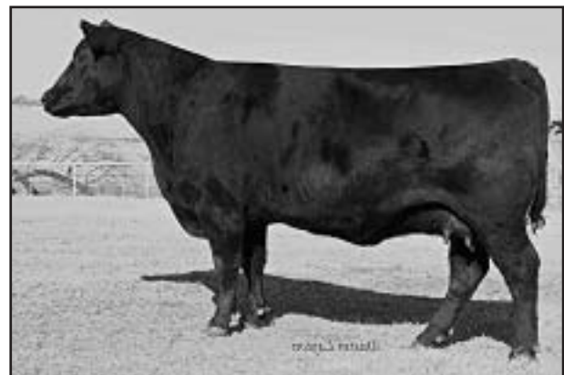
E&B Lady Precision 310 - Dam of Lots 50-57