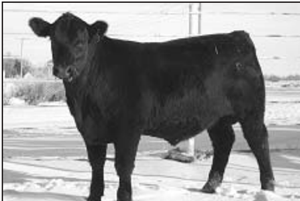
E&B Retail Product 7115 - Lot 61