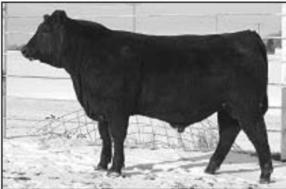
E&B Retail Product 7101 - Lot 78

• These Retail Products are out of one of the top 598 daughters in the herd. These bulls have the power to be herd builders. Check them out. You will not be disappointed. Dams WR 3/105.