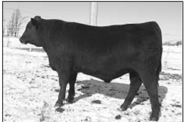
E&B Predestined 757 - Lot 57