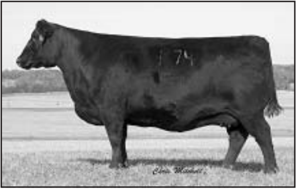
E&B Lady Erica 174 - Dam of Lots 4-10 and 60-65

• These 2V1 sons out of E&B Lady Erica 174 scanned well and should add strength to their offspring on carcass and maternal. We believe 174 is one of the very best EXT daughters anywhere. Note how she is bred on the bottom side. Werner Angus in Illinois bought the last half of her this winter. We will have many more calves from her in 2008. Dams WR 3/107 and YR 3/101.