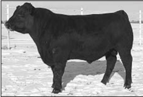
E&B 1023 Precision 755 - Lot 71

• Full brothers in blood to Lots 71 and 72. Lady 373 is another powerful 036 cow from E&B Lad EXT 858. These are also outstanding heifer bulls. WR 2/106, YR 2/106.