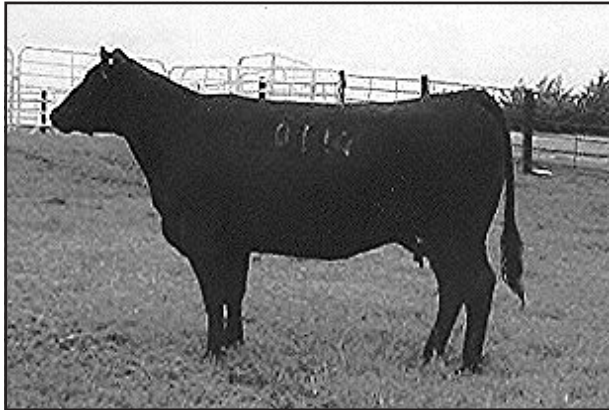
E&B Everelda Queen 0117 - Grand dam of Lot 92

Receive a 5% discount if you purchased a bull from last years sale.